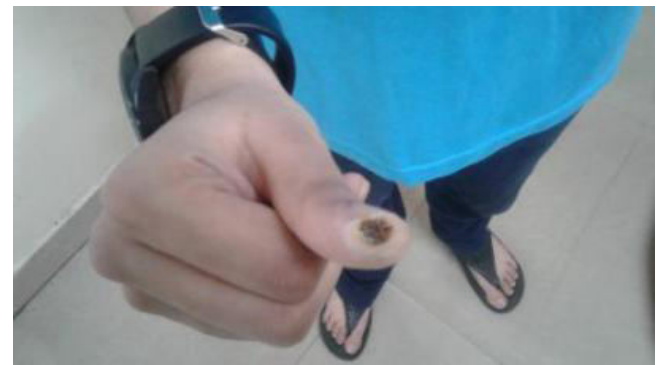
3 rd sitting of Agni Karma