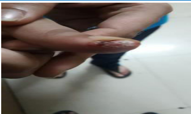
1 st sitting of Agni Karma