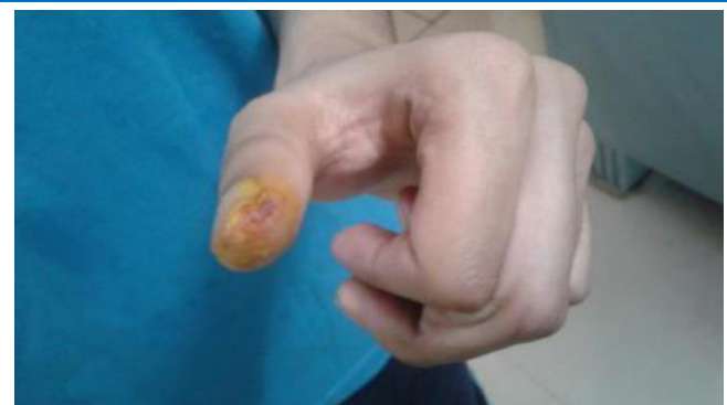
4 th sitting of Agni Karma