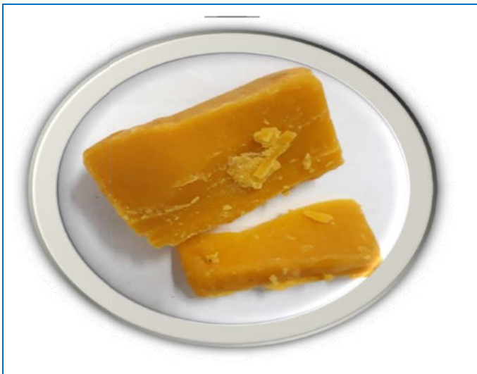
Market sample (1)