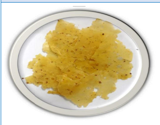
Original beeswax (1)