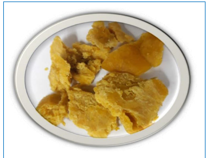
Original beeswax (2)