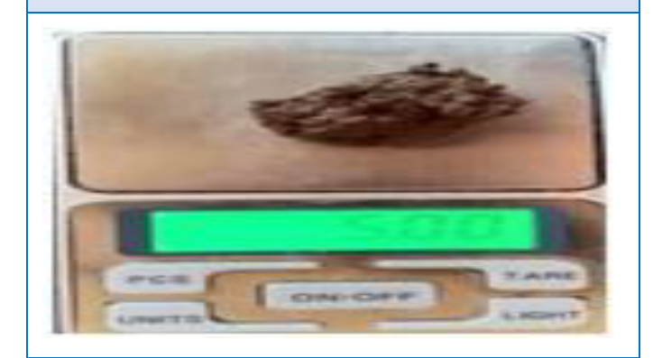
Weighing 5 grams