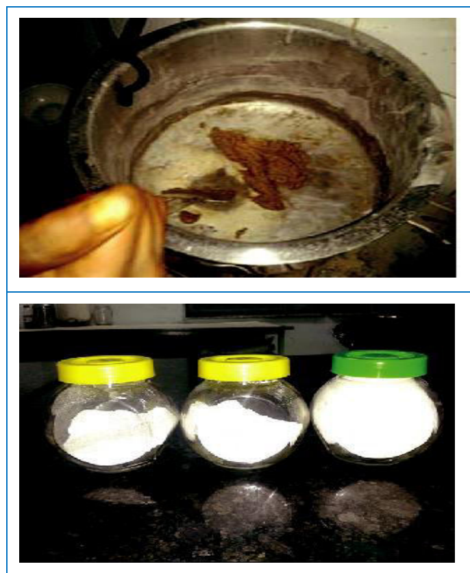
Figure 2: Preparation of PalashaKshara . (a) Measured Palasha ash. (b) Ash dissolved in water. (c) Filtration of Ksharajala . (d) Evaporation of Ksharajala . (e) Last stage of Kshara Preparation. (f) Prepared Kshara stored in airtight glass bottle.