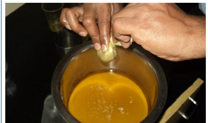
Fig. 3: Filtering using five folded cloth