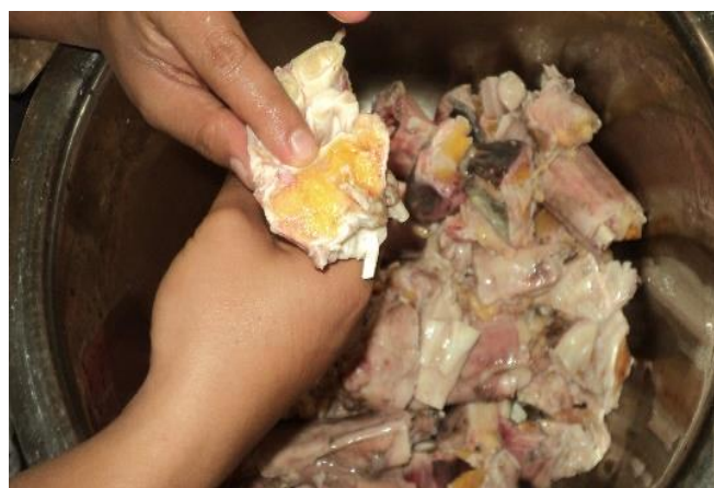
Fig. 1: Crushing the bones

Externally the Majja Sneha can be administered as in the form of Shirobasti (warm oil poured onto the head) [21] and followed by Shiropichu (keeping sterile cotton pad on head dipped in herbal oil). [22] Shirobasti requires two litres of Sneha and was retained for 40 minutes. Shiropichu was taken in sufficient quantity to soak the cotton laid over the scalp and is kept for 40 minutes.