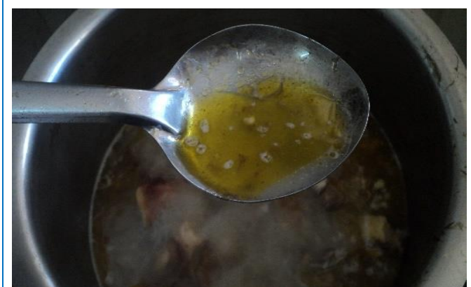
Fig. 4: Mixing the Deepaniya Gana Dravyas