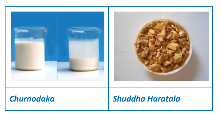
Table no 3 reveals that Sample 1 i.e. Ashuddha Patra Haratala is having yellowish with brown tinge with shiny, peculiar odor with crystalline smooth surface. Sample 2 i.e. Shuddha Haratala (Kushmanda Swarasa Shodhita) was bright yellowish shiny, aromatic, crystalline smooth. Sample 3 i.e Shuddha Haratala (Tila Kshara Jala Shodhita) was yellowish dull color, peculiar odor, and crystalline smooth texture. Sample 4 i.e Shuddha Haratala (Churnodaka Shodhita) was

Figure 4: Pictures depicting Shodhida Haratala by Churnodaka .