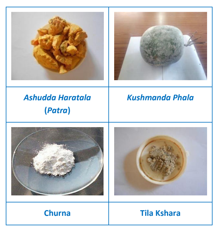
Figure 1: Pictures depicting raw drugs used for Haratala Shodhana .