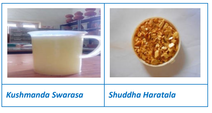
Figure 3: Pictures depicting Shodhida Haratala by Tila Kshara Jala .