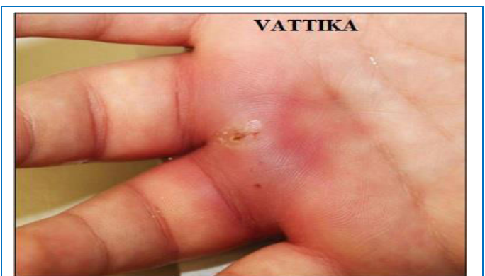
Vataja Vrana Shopha