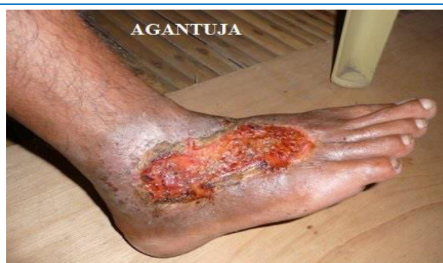
Agantuja Vrana Shopha

Aetiopathogenesis of Shopha is much resembled to inflammation. It is defined as local response of tissue to any kind of injury. Sushruta mentioned that Shopha occurs in sequential pattern, in six different stages called Shatkriyakala . [4] They are respectively as: