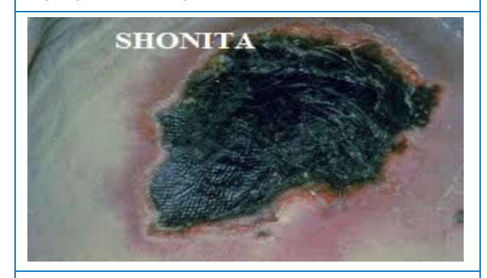
Shonitaja Vruna Shopha