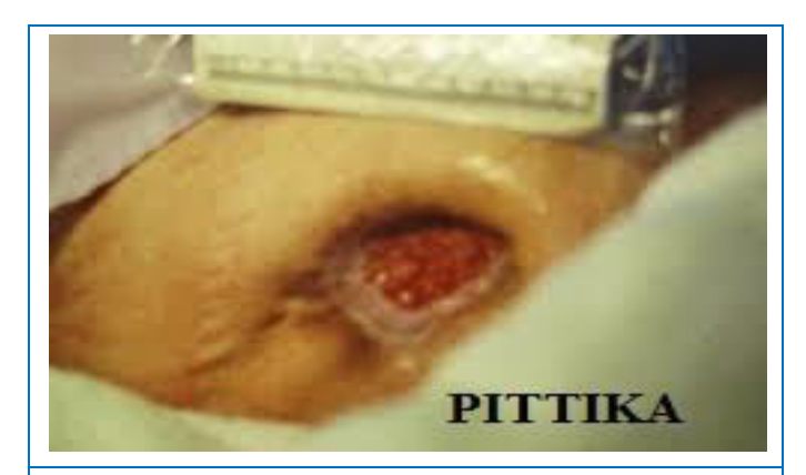
Pittaja Vruna Shopha