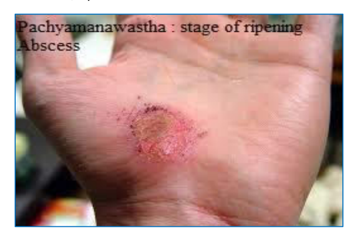
3) Pakwawastha: Stage of riped abscess (suppuration)

This stage produced symptoms like as<sup>[6]</sup> Pricking and other types of pain, Discolouration of skin, burning sensation, Pyrexia etc.