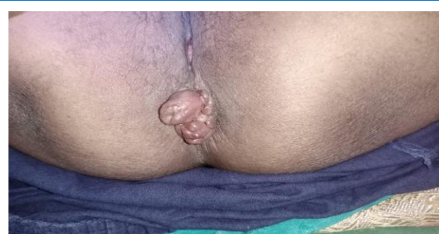
03-12-2021, after Jalouka treatment and before Ksharasutra application.