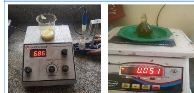
Fig. 2: Physio chemical analysis of Bala Shatavaryadi Ghrita