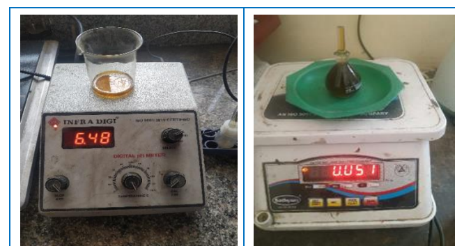
Fig. 1: Physio chemical analysis of Saha Ashwagandhadi Taila