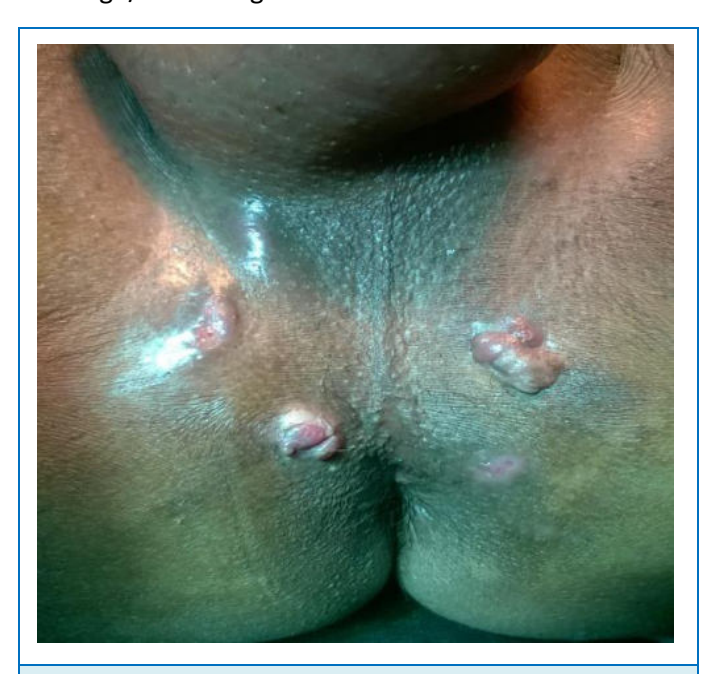
Fig. 1: Before Treatment

5cm with unit cutting time 13.6 days/cm, 3 months for third (external to external) length 8cm with unit cutting time 11.25 days/cm and 1 month for 4th thread (external to internal) length 4cm with unit cutting time 7.5 days/cm required for complete cutting and healing of fistulous tracts. The time taken for complete cut through of track differs due to length of track and patient's pain tolerance. The unit cutting time (UCT) = Total no. of days taken for cut through/Initial length of track in cms.