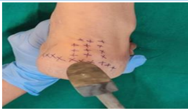
Agnikarma done with Panchadhathu Shalaka over tender points