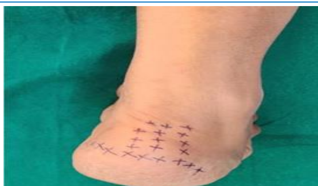
Tender points marked