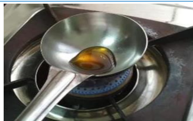
Heating of Kshoudra