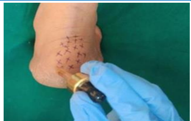
Agnikarma done with Kshoudra over tender points