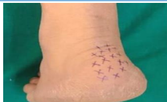
Tender points marked