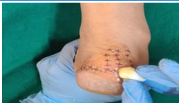
Application of Madhu Sarpi mixture