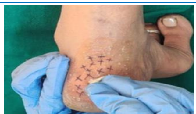
Application of Madhu Sarpi mixture