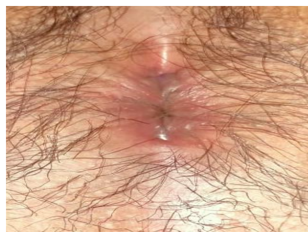
Fig. 2: After Treatment - Complete Remission of Acute Fissure-in-ano