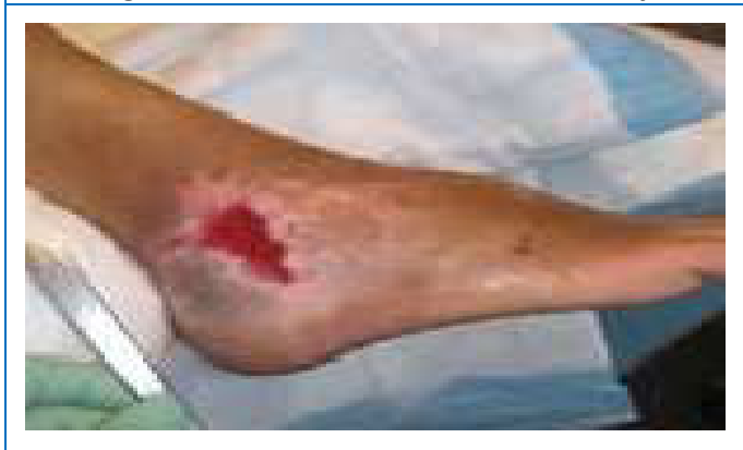
Figure 4: Clinical Presentation on 21<sup>st</sup> Day