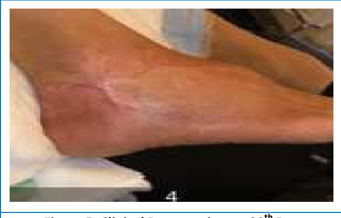
Figure 5: Clinical Presentation on 30<sup>th</sup> Day

Leech therapy was repeated once in week for 4 sittings. Total duration of treatment was 30 days Patient was advised to continue Anti-diabetic medicine (Tab Glucored - BD BT). Changes occurred during and after the treatment period was assessed according to wound parameters.