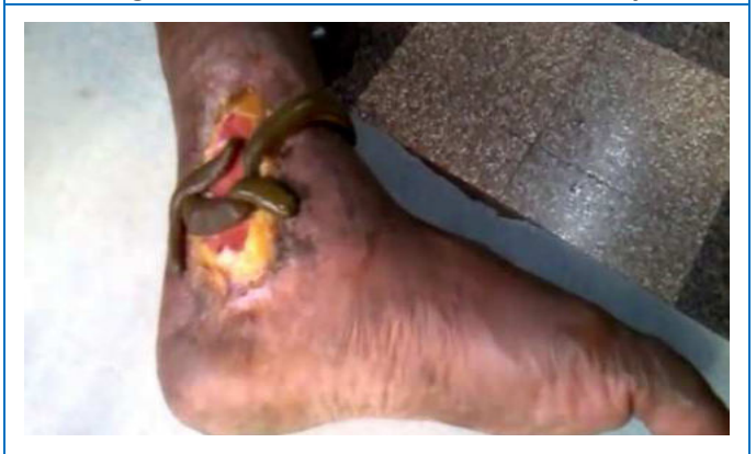
Figure 2: Leech application

Figure 1: Clinical Presentation on 1^{st} Day