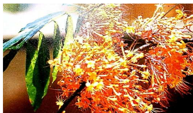
Figure 1: Ashoka ( Saraca Asoca Roxb.) tree with flowers

Accordinging of Ayurvedic literature it is has found that Ashoka bark has very good effect in treating gynaecological disorders.