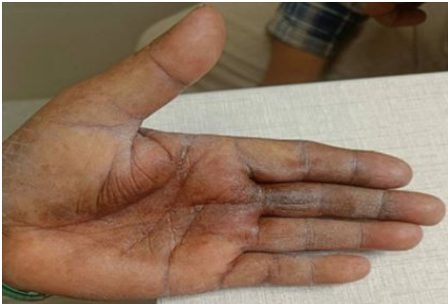
Figure 2: After treatment