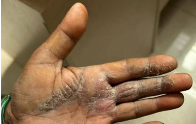
Figure 1: Before Treatment

On first visit patient had severe itching, peeling of skin and cracks over palms. Over subsequent visits itching, peeling and cracks reduced drastically.