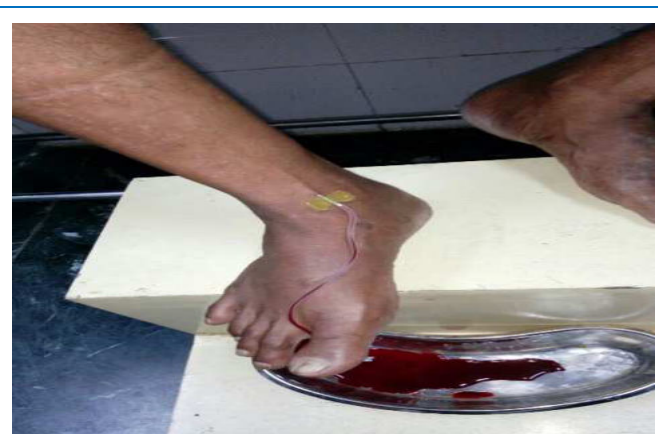
Fig. 1: Siravyadhana