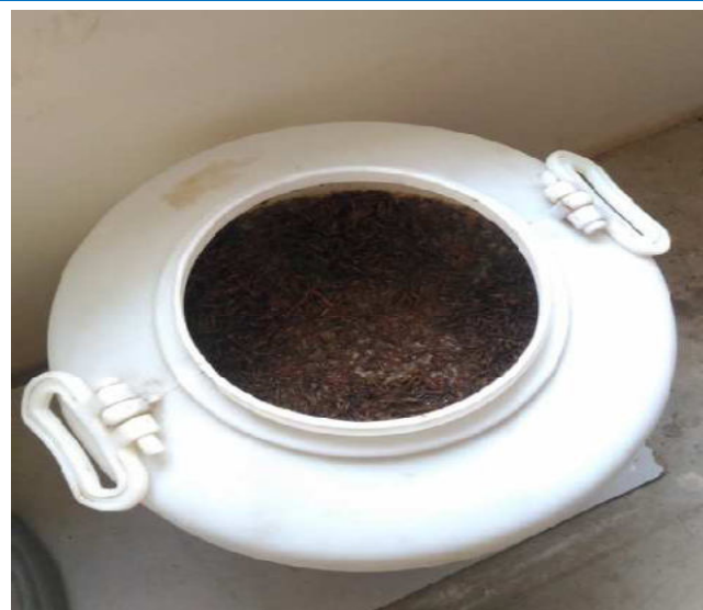
Fig. 3: Fermentation