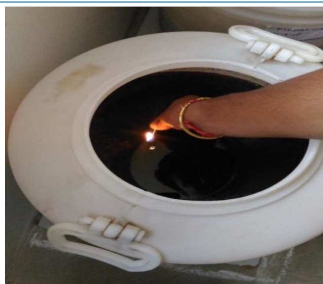
Fig. 2: Candle Test