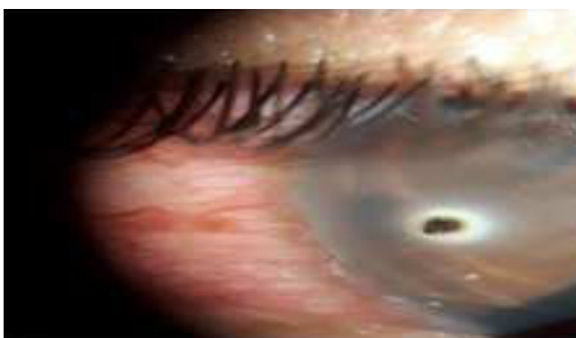
Fig. 1: Before removal of foreign body