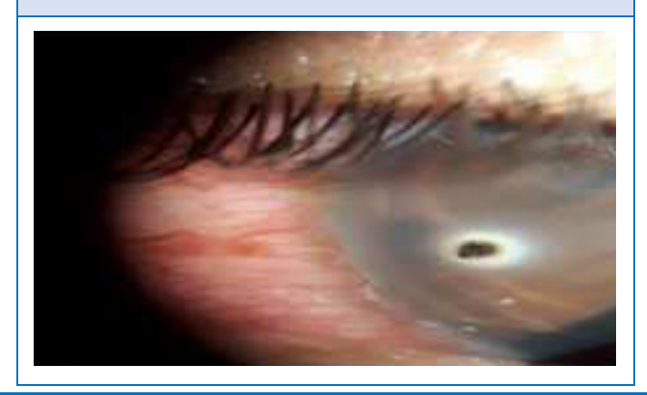
Fig. 1: Before removal of foreign body