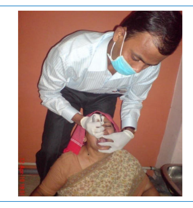
Fig. 2: Dantodharana by Jalandhara Bandha