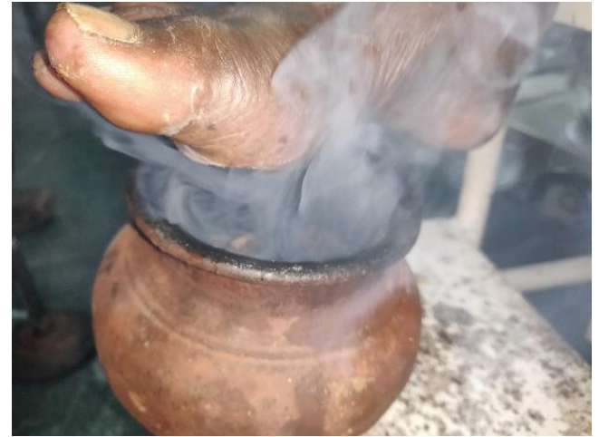
Fig. 4: Vrana Dhupana

Other medicines: Inj. Insugen 30/70 According to sliding scale