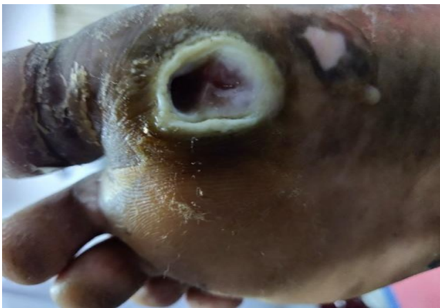
Fig. 6: On the day of admission