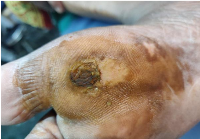
Fig. 11: On 27 th day - The wound completely healed