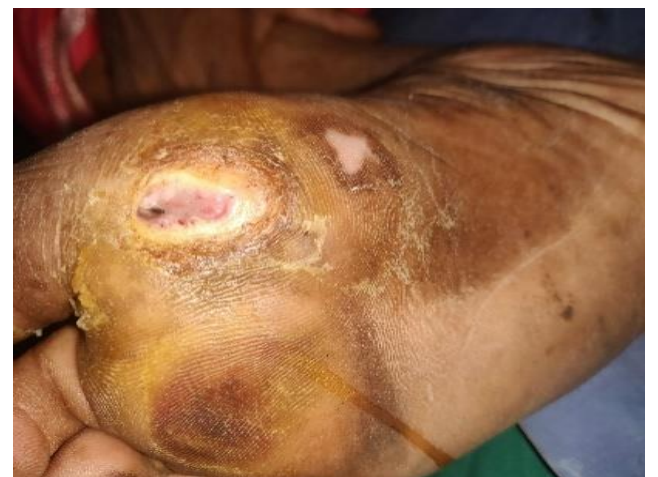
Fig. 10: On 20 th day - It was observed that wound size was markedly reduced.