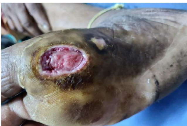
Fig. 7: Wound on 5 th day - The healing was started with the formation of healthy granulation tissue. The wound started to contract by filling of tissue from the base of the wound day by day.