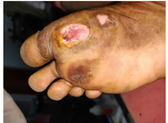
Fig. 8: Wound on 10 th day - Roohyamanavrana - Kapota Varna Pratima , Kledavarjita , Sthira , Pitikavanto .