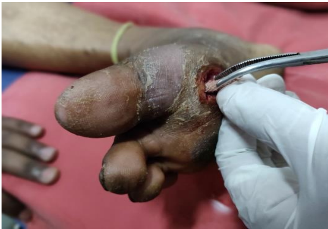
Fig. 5: Kshara Picchu insertion