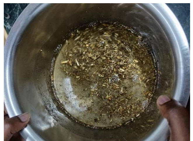
Fig. 1: Aragwadhadi Qwatha Choorna with Water

Preparation of Aragwadhadi Qwatha: Required quantity of Aragwadhadi Qwatha Choorna was taken and boiled in 8 parts of water and was reduced to one fourth and filtered in a clean vessel. The filtrate was used luke warm for Prakshalana . (Fig.1)