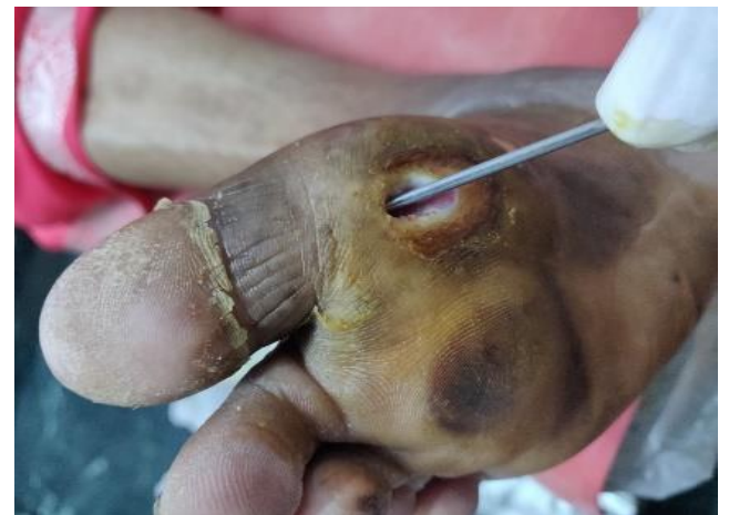
Fig. 9: Depth of the cavity - 1 cm on 15 th day