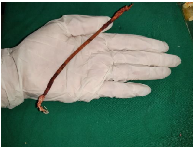
Fig. 3: Chitraka Kshara Picchu