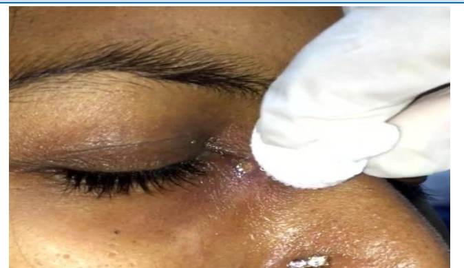
Observation made on 5/6/18