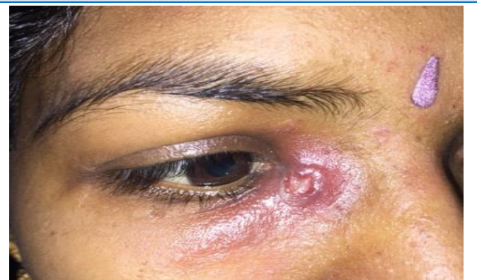
Observation made on 22/5/18