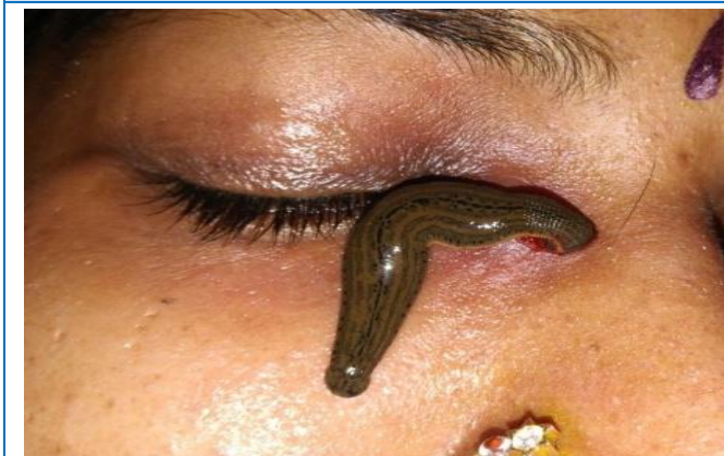
Observation made on 9/5/18