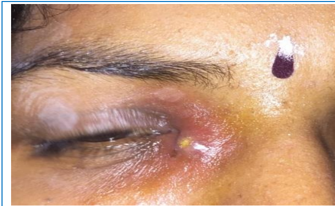
Observation made on 8/5/18