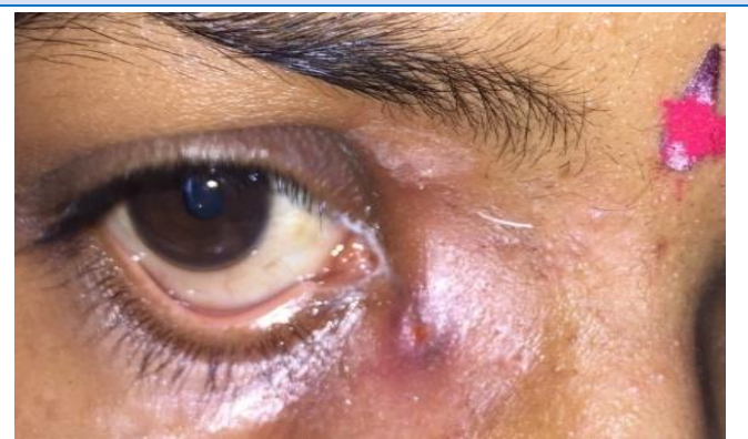
Observation made on 25/5/18