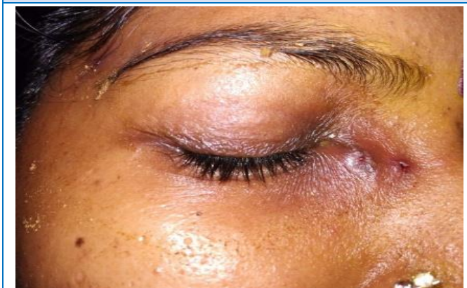
Observation made on 10/5/18