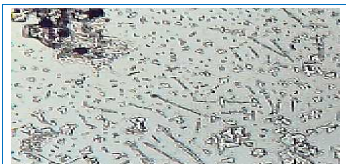
Calcium oxalate crystals