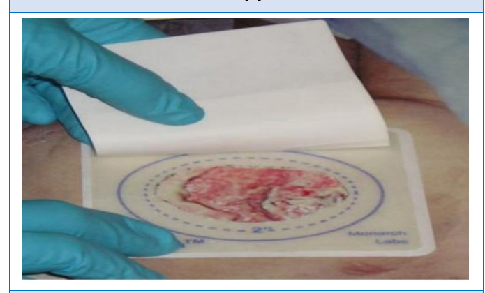
Loose form of larvae therapy