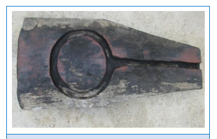
Figure 4: Wooden plate to be placed between two logs in Tirhi apparatus