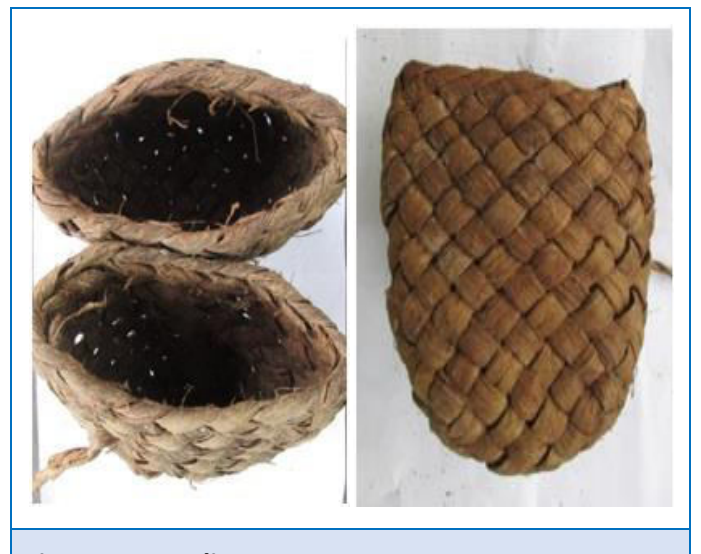
Figure 5: Pottali

Pottali is made from the fibre of Bauhinia vahlii plant. It diameter is 13cm and height is 6cm.