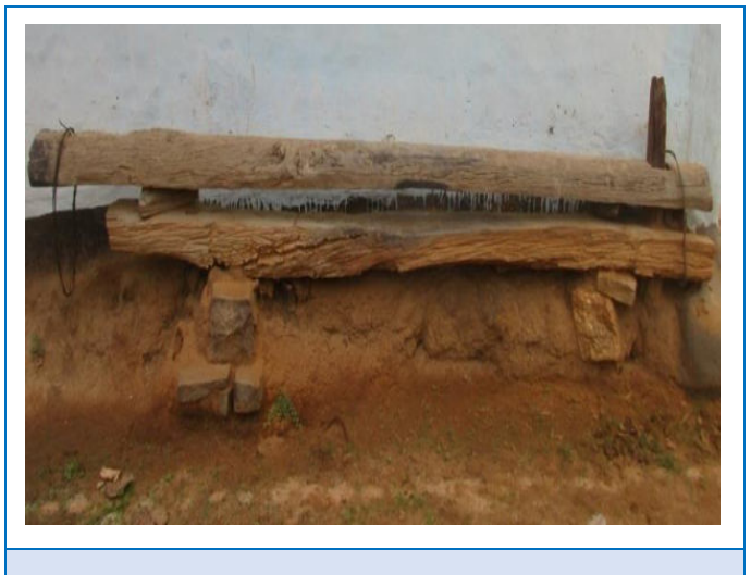
Figure 2: Tirhi apparatus

Tirhi is a manual apparatus used to extract oil from different seeds. It is completely made of wood. Two parallel logs of wood temporarily joined at one end by iron ring. Upper log of wood is 2.3m and lower log is 2m in length. Its width is 22cm. The Pottali is kept between these two logs of wood. At the base of Pottali a wooden plate is kept. Length of this wooden plate is 54cm. This plate has an apex and a base. Base is 23cm wide is apex is 12cm wide. There is a circular furrow in the centre, which has diameter of 14cm. Total thickness of this plate is 6cm. When the two logs of wood are pressed towards each other, extracted oil flows through the furrow made on the wooden plate and are collected in the container.