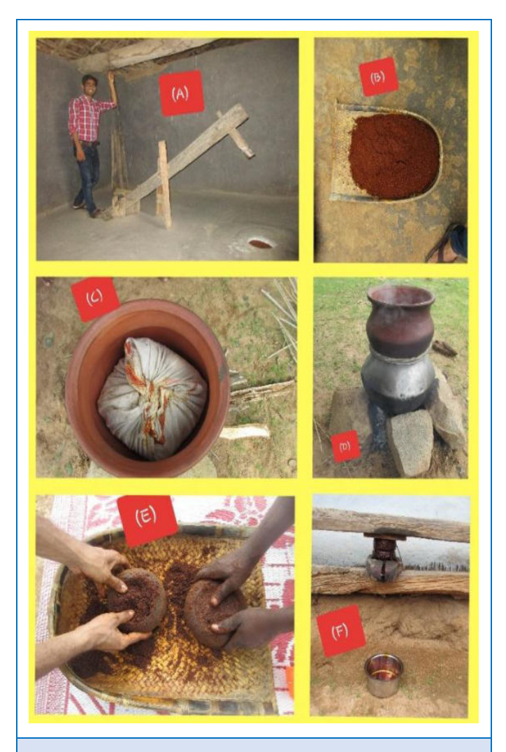
Figure 3: Procedure of Oil extraction by traditional method (a) Crushing of seed, b) crushed seeds, c) Crushed seed tied in Cotton cloth, d) Steaming, e) Steamed seeds Filling in Pottali , f) Pressing by Tirhi )