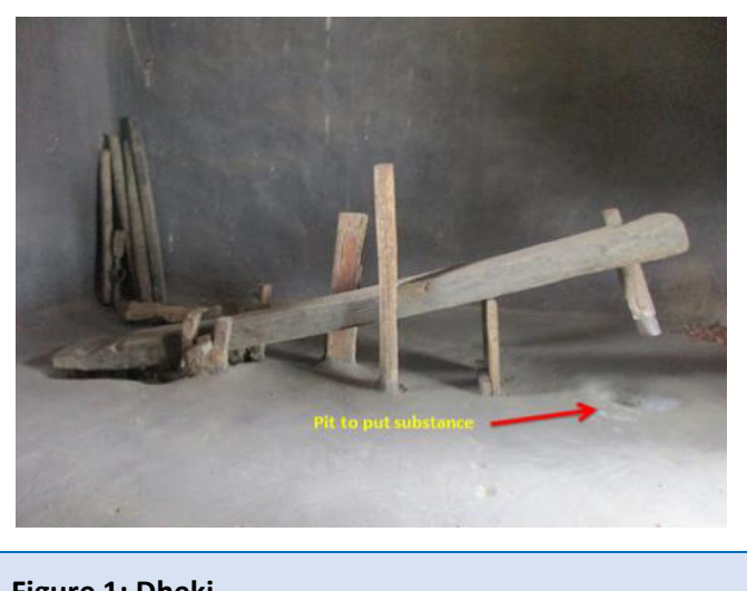
Figure 1: Dheki